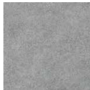
LIGHT GREY CONCRETE