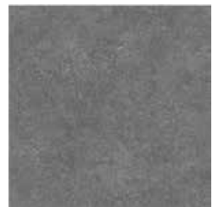
DARK GREY CONCRETE

*The Printed decors only give an impression of the real colors and variation of colors and tones in the design, but are not identical to the real color.